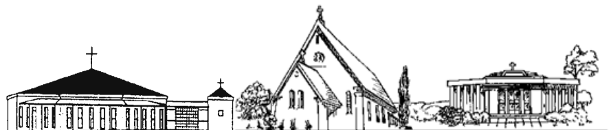
Church of the Nativity 26 Sunnymead Drive Aberfoyle Park

We pray that those who risk their lives for the Gospel in various parts of the world inflame the Church with their courage and missionary enthusiasm.